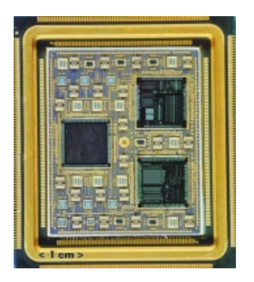
Figure 1. Example of an MCM-C in ceramic packaging: the SPARC computer in VFL technology

Many different types of electronic hardware, such as telephones, radios, television sets, computers, etc., have become part of our daily lives, and these objects are becoming smaller and lighter with every product generation. Driven by cost and environmental considerations, and enabled by significant advances in, and a growing variety of packaging and interconnect technologies, we are enjoying an ever-improving price/performance ratio.