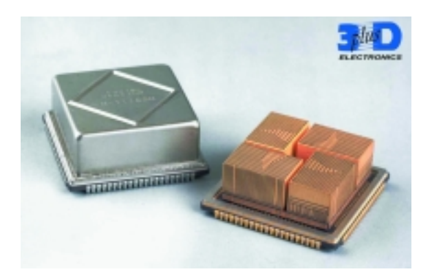
Figure 2. Example of MCM-V: the 640 Mb memory module for the Solid-State Recorder of the Cluster-II spacecraft

For Level-1, we have SCMs (Single-Chip Modules), Hybrids, and MCMs (Multi-Chip Modules), and the WG identified the following areas of technology evolution: