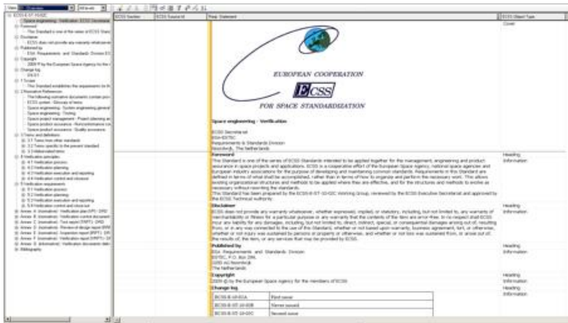
Figure 5-2: Main view of DOORS Module

In this selected view, the content of the standards is organized and displayed in columns: